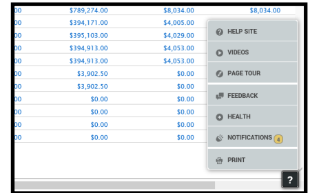
New floating Help menu